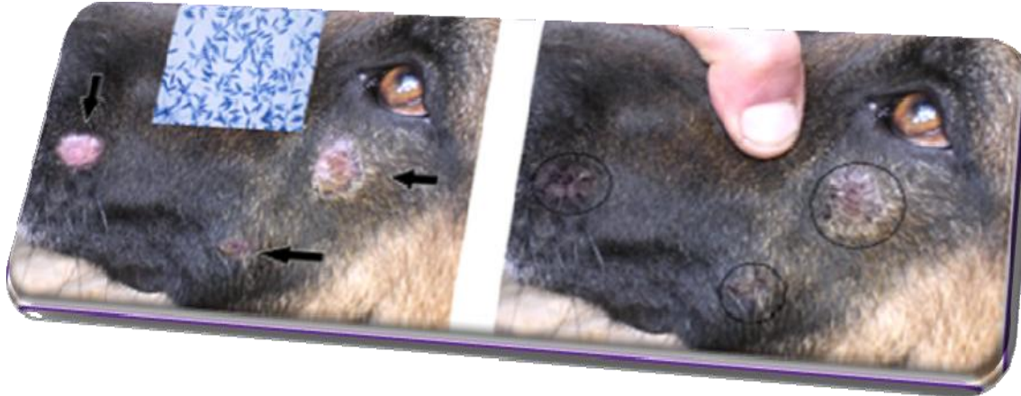
Figure 2: Plate (1) Typical Fungal skin infections in dogs face showing circular lesion detected by scraping and fungal culture. Left: before treatment; right: after treatment

Although the present study did not examine the exact mechanism of action, we believe that the bactericidal and the fungicidal effect of Envirolyte-Anolyte against bacteria and fungi were due to the combined action of hydrogen